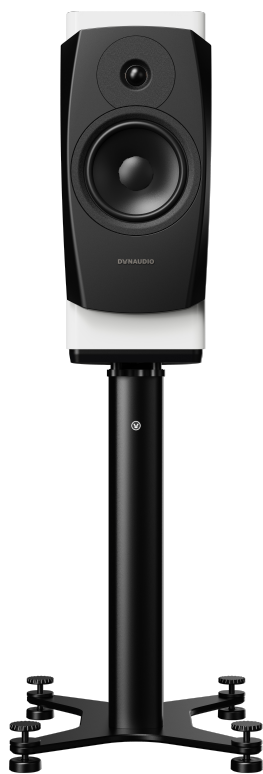
Snow High Gloss