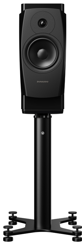
Space High Gloss